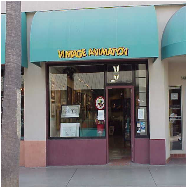
Third Street Promenade