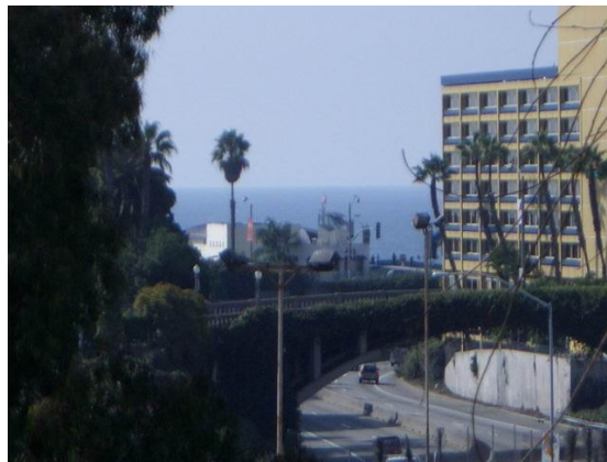
1640 5 th Street Suite 204 interior shots and view