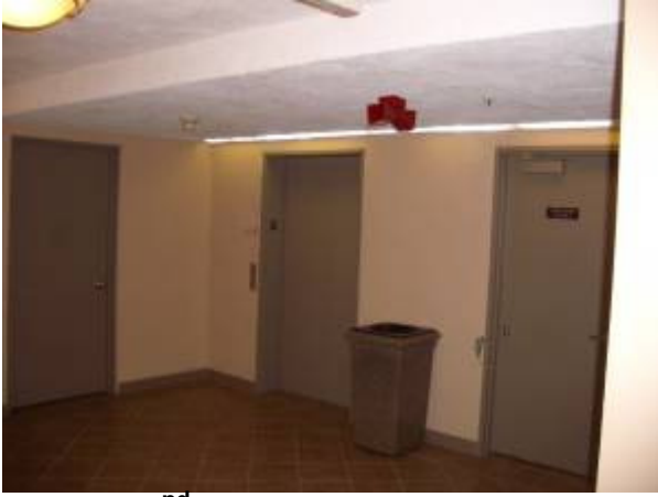
2 nd Floor Lobby