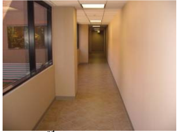
2 nd Floor Corridor