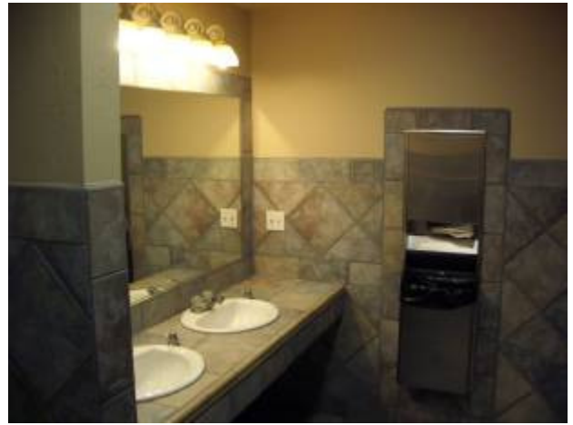
2nd Floor Restrooms