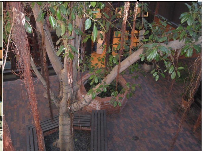
Common area courtyard