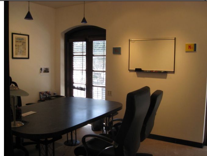
Executive office with balcony