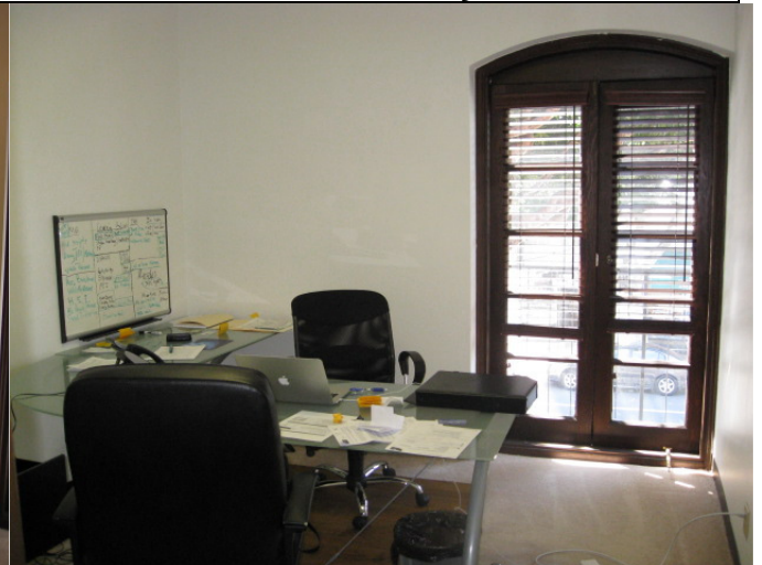
Office with balcony