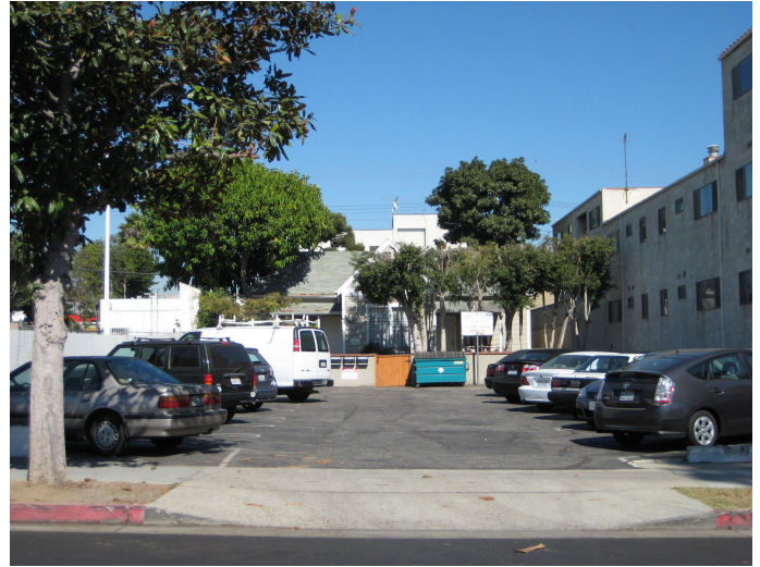
Parking Lot + 3 units - 1417 Euclid Street