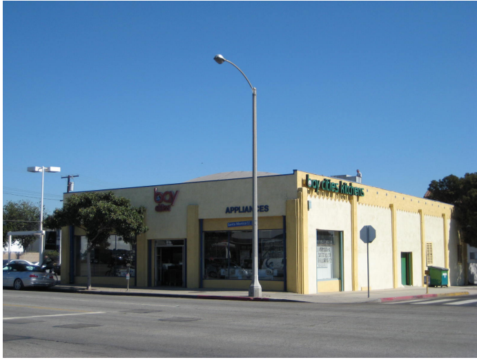
Retail Building - 1302 Santa Monica Boulevard